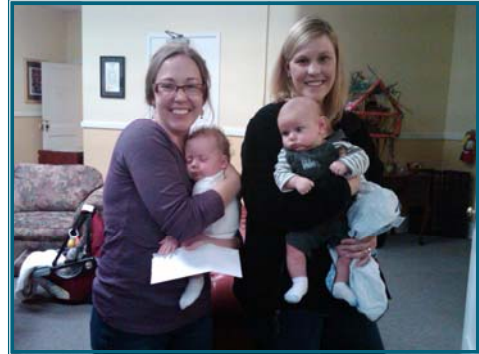
Enjoying a tour of the Open Door Home.